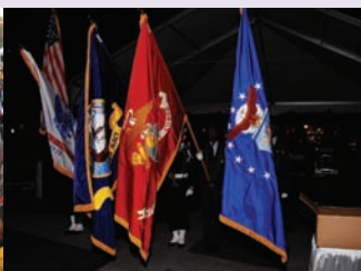
The Tri-Color Guard Presents Flags