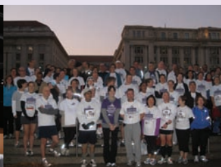
Mandy Moore and the Surgeons Team