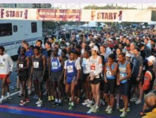
GCF's Race to End Women's Cancer